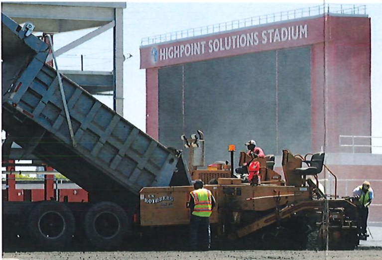
Rutgers University, Piscataway, NJ