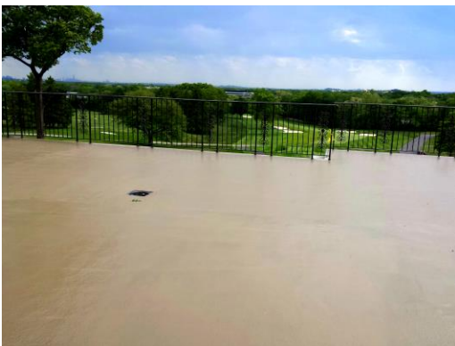
Pedestrian Deck Coating

At SMART we are dedicated to offering our customers cost effective, quality repairs by working closely with engineers, material manufacturers, and owners throughout the repair process. From start to finish, we strive to complete projects so they meet the needs of the facility, tenants, and ownership. SMART will customize each project so safety, production, and budgetary needs are addressed efficiently and economically.