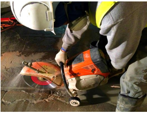
Dust Controlled Concrete Repairs