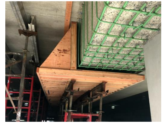
Shoring, Steel Reinforcing, and Custom Formwork

We understand you have deadlines to meet and appearances to maintain. We will safely complete jobs in timely fashion and with minimal impact on your tenants and the public's view.