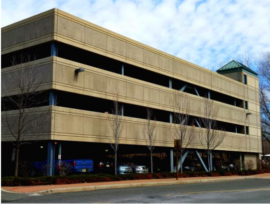
Parking Garage Repairs and Coatings